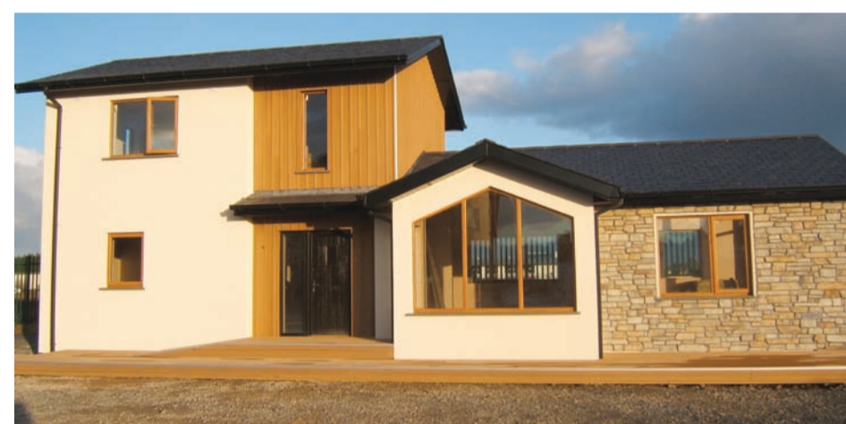
Caption here place caption here caption here place caption here

The Closed Panel System is a factory-made product. Closed Panel technology builds upon the benefits of timber frame and takes it to a whole new level. The wall panels come pre-insulated, finished internally with fibre-board ready for plastering, with pre-installed conduit for electrical wiring, external windows and doors installed in the factory and walls can even come externally finished ready for render. This vastly reduces the requirement for subcontractors on site, eliminating many of the onsite costs, problems, wastage and overruns, providing the developer with one single focused point of